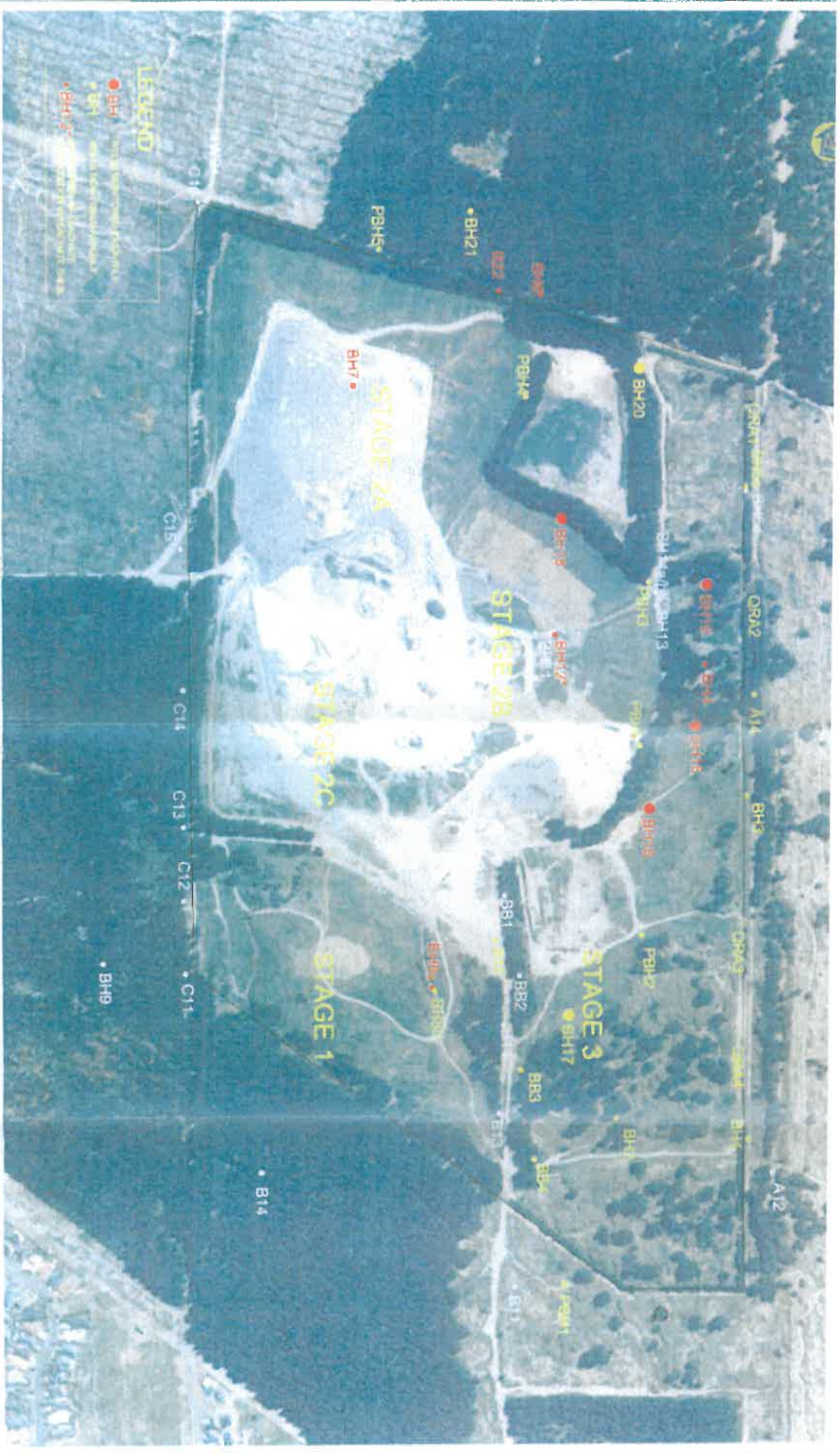
BURWOOD LANDFILL CONSENT VARIATION REPORT BURWOOD LANDFILL PROPOSED GROUNDWATER MONITORING PROGRAMME FIGURE 3-1 A